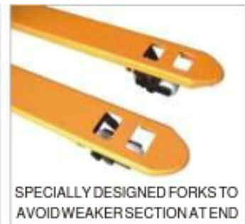
SPECIALLY DESIGNED FORKS TO AVOID WEAKER SECTION AT END