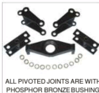
ALL PIVOTED JOINTS ARE WITH PHOSPHOR BRONZE BUSHING