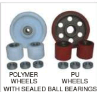
POLYMER WHEELS WITH SEALED BALL BEARINGS PU WHEELS