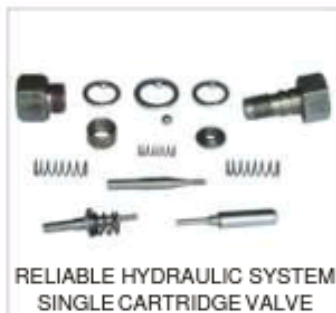
RELIABLE HYDRAULIC SYSTEM SINGLE CARTRIDGE VALVE