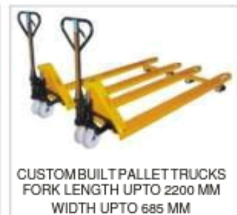
CUSTOM BUILT PALLET TRUCKS FORK LENGTH UPTO 2200 MM WIDTH UPTO 685 MM