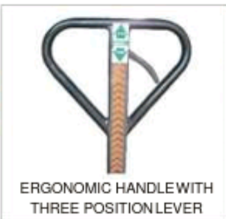
ERGONOMIC HANDLE WITH THREE POSITION LEVER