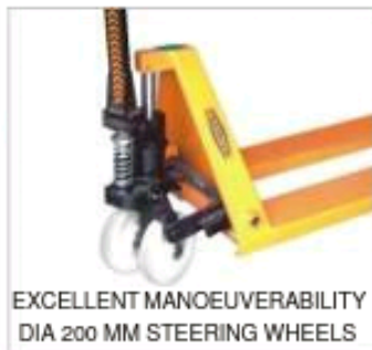
EXCELLENT MANOEUVERABILITY DIA 200 MM STEERING WHEELS