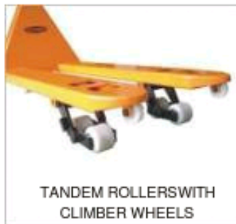
TANDEM ROLLERS WITH CLIMBER WHEELS